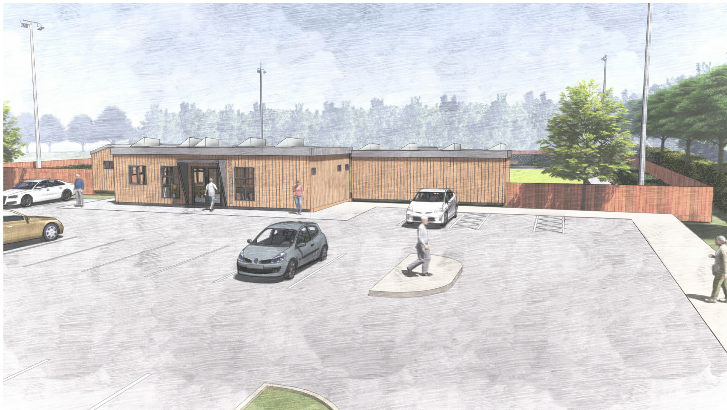
View of main access from the car park