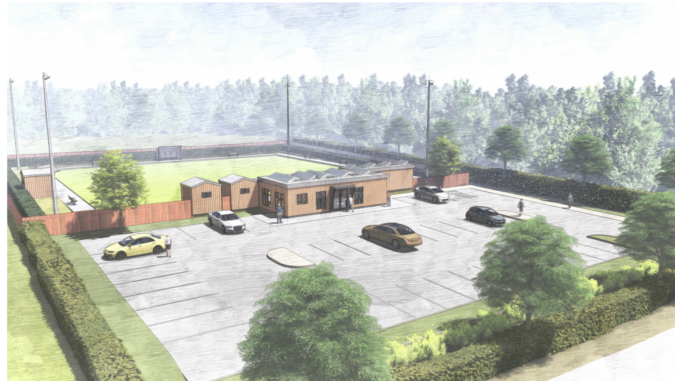
General view of the proposal from the East