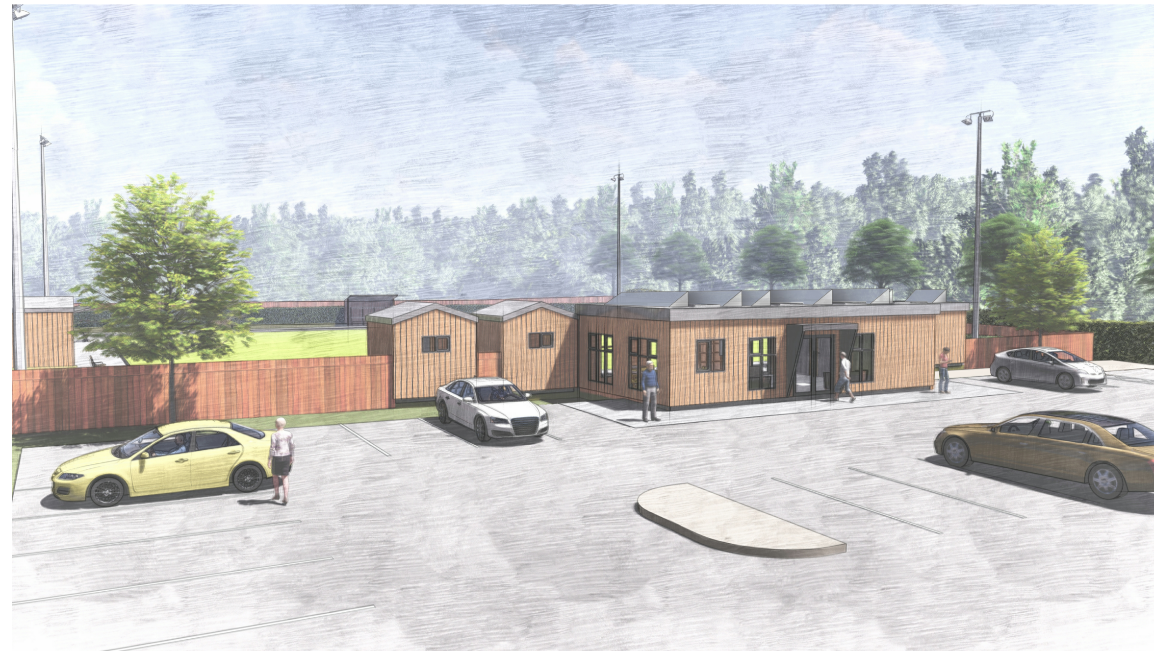
View of main access from the car park