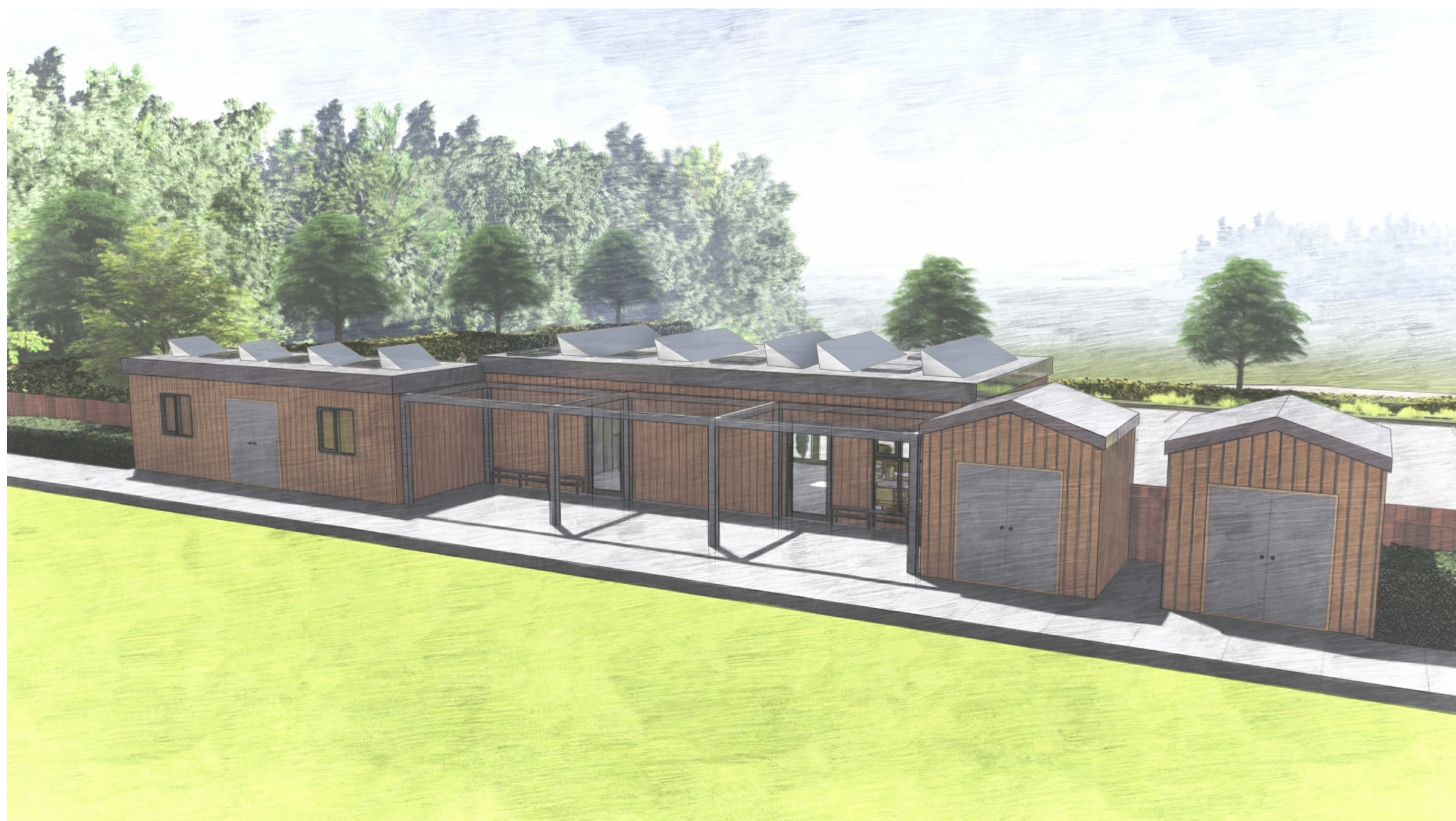
View of main Coaching Cabin, Pavilion/Officials Shelter and Storage Shelter