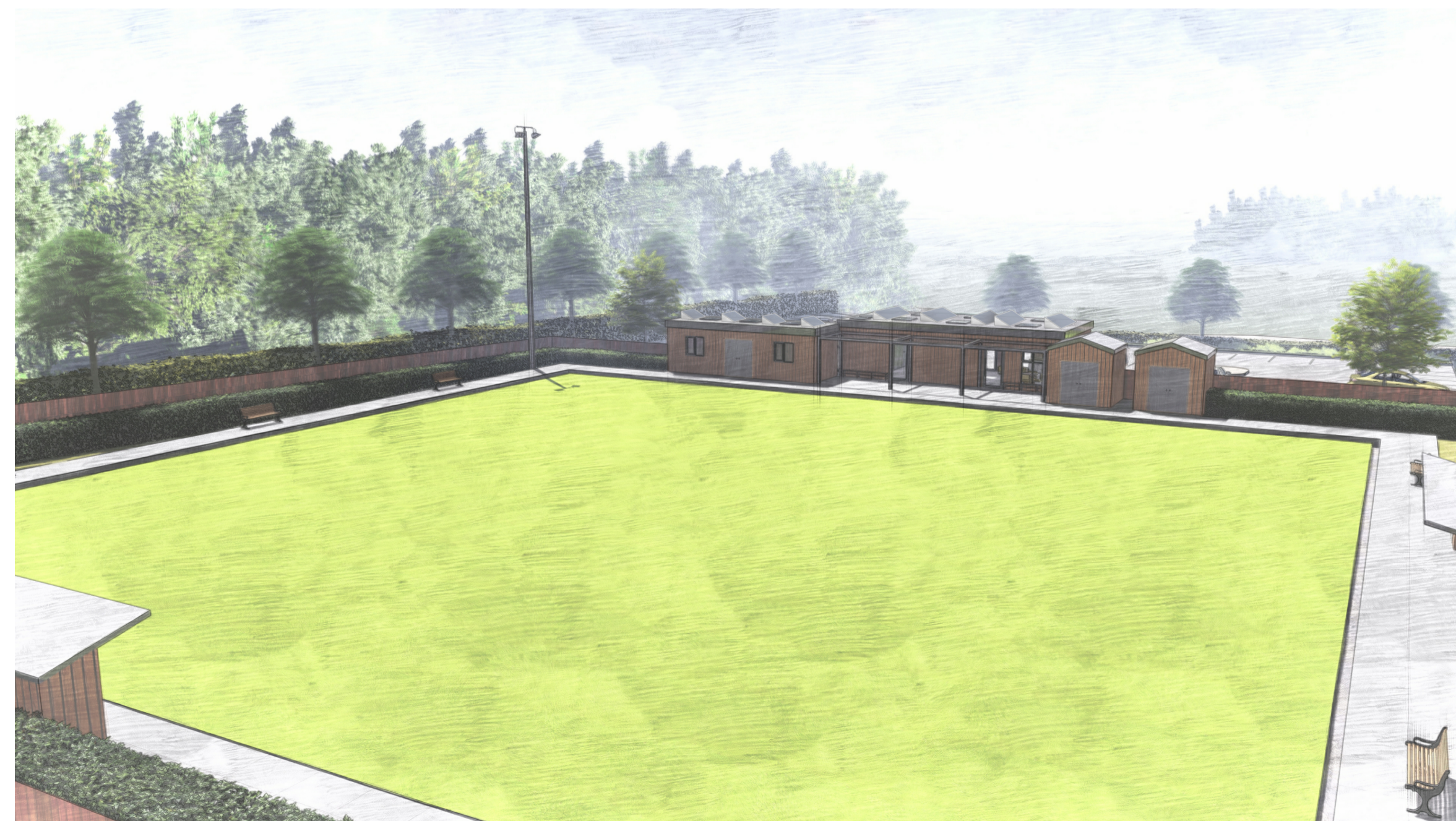
General view of the proposal from the West

© Crown copyright 2018 Do not scale from drawings. Verify all dimensions on site prior to construction. This drawing is to be read in conjunction with all relevant documents and drawings. Report all discrepancies to MoJ immediately. No unauthorised use, disclosure, storage or copying.